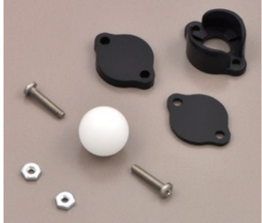
Pololu ball caster with 1/2" plastic ball with included hardware.