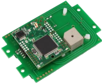
TWN4 OEM PCB Bottom View