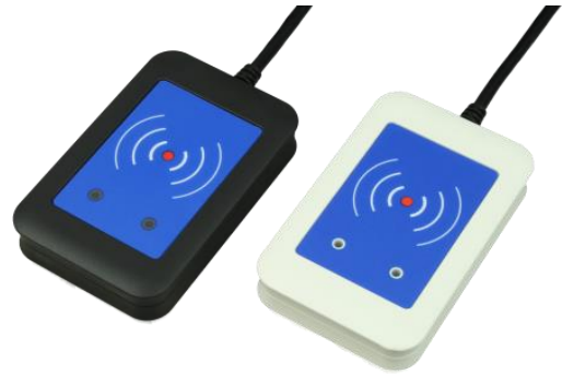
Desktop Top View

Elatec's TWN4 Family allows users to read and write to almost any 125kHz/134.2kHz and 13.56MHz tags and/or labels. It supports all major transponders from various suppliers like ATMEL, EM, ST, MIFARE NXP, TI, HID, LEGIC, etc. and ISO standards like ISO14443A/B including layer 4 (T=CL), ISO15693, ISO18092 / ECMA-340 (NFC).