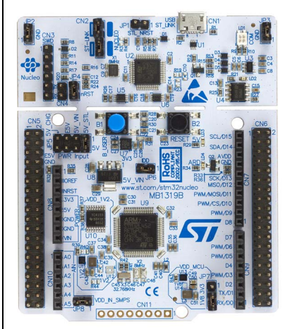
Top view of a NUCLEO-XXXXRX-P board | Top view of a NUCLEO-GXXXRX board. with SMPS.