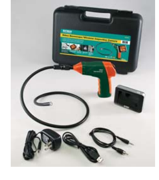
Complete with 4 AA batteries. rechargeable display battery, microSD memory card with SD adaptor. USB cable, video interconnect cable, AC adaptor (100-240V. 50/60Hz), magnetic base stand, and hard case

- HVAC and Refrigeration Electrical inspection - Automotive - Pest control