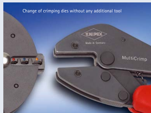
Change of crimping dies without any additional tool

The electrician travelling in mobile services needs at least 3 different crimping pliers to be prepared for crimping of the most common standard connectors. The new MultiCrimp system now offers the compact solution for the professional user: a set of optionally 3 or 5 interchangeable crimping dies in a quick changer magazine for the most common applications on the spot.