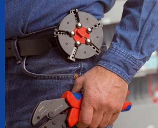
Round magazine with belt clip: interchangeable dies are always ready to hand