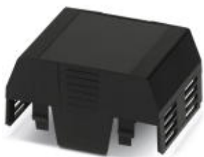
Component housing, without connection opening, Upper part, color: black, width: 52.5 mm

Please be informed that the data shown in this PDF Document is generated from our Online Catalog. Please find the complete data in the user's documentation. Our General Terms of Use for Downloads are valid ( http://phoenixcontact.com/download )