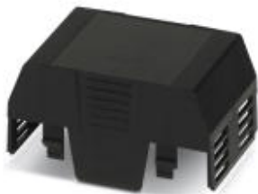
Component housing, without connection opening, Upper part, color: black, width: 45 mm

Please be informed that the data shown in this PDF Document is generated from our Online Catalog. Please find the complete data in the user's documentation. Our General Terms of Use for Downloads are valid ( http://phoenixcontact.com/download )