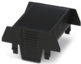
Component housing, connection opening on both sides, Upper part, color: black, width: 70 mm

Please be informed that the data shown in this PDF Document is generated from our Online Catalog. Please find the complete data in the user's documentation. Our General Terms of Use for Downloads are valid ( http://phoenixcontact.com/download )