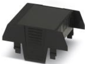
Component housing, connection opening on one side, Upper part, color: black, width: 52.5 mm

Please be informed that the data shown in this PDF Document is generated from our Online Catalog. Please find the complete data in the user's documentation. Our General Terms of Use for Downloads are valid ( http://phoenixcontact.com/download )