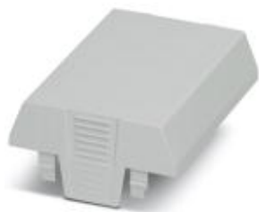
Component housing, without connection opening, Upper part, color: gray, width: 90 mm

Please be informed that the data shown in this PDF Document is generated from our Online Catalog. Please find the complete data in the user's documentation. Our General Terms of Use for Downloads are valid ( http://phoenixcontact.com/download )