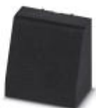
Component housing, color: black, width: 22.5 mm

Filler plugs - EH 22,5-FP/ABS BK9005 - 2201842