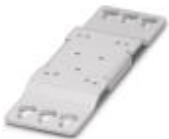
Universal wall adapter

Assembly adapters - UWA 182/52 - 2938235