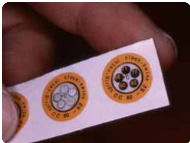
CelsiClock® with 5 temperature levels. CelsiClock®'s are also available with other temperature values and arrangements.