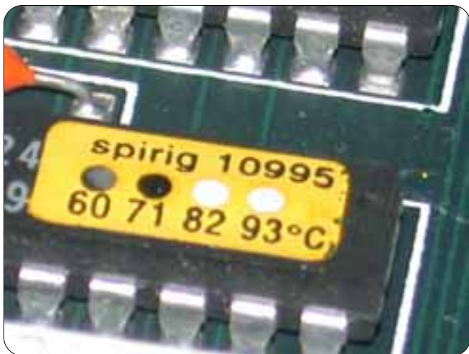
MICRO-CelsiStrip® with temperature levels 60 and 71°C surely exceeded. The 82°C never reached in the label's watch mission.