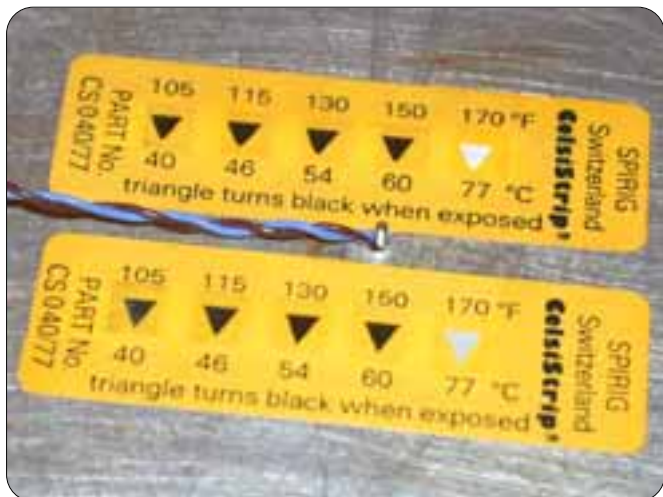
CelsiStrip® with 5 temperature levels. Also 8 levels (not shown here) available. Here 60°C are exceeded but 77°C never reached.

Apply and Forget! irreversible temperature level recording labels. Self-adhesive, easy applicable on any surface. Forty levels to choose from +40°C (105F) to +260°C (550F) and arranged in various combinations. Accuracy ±1,5%. Permanent blackening of the original white level clearly indicates that level had been exceeded.