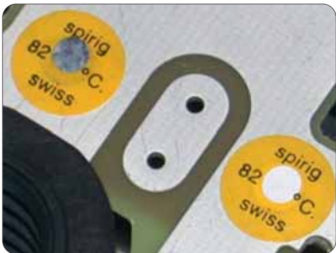
CelsiPoint® with one 82°C level. CP on left side exceeded and on right side never exposed to or above 82°C.