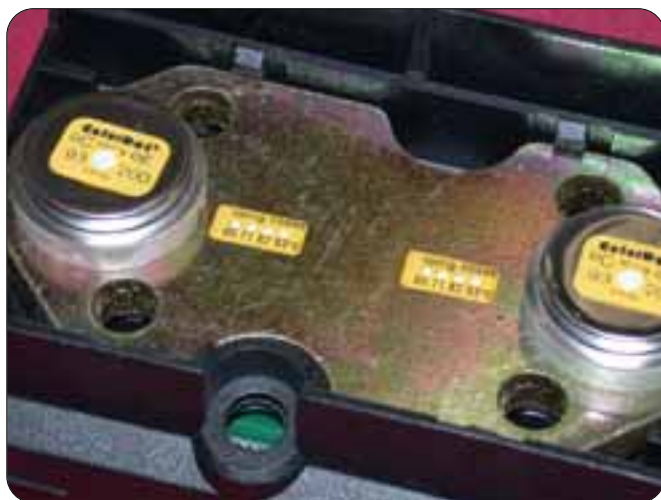
CelsiDot® 's with 93°C level and MICRO-CelsiStrip® s on an assembly before test.

e - s h o p - - - > w w w . c e l s i . c o m