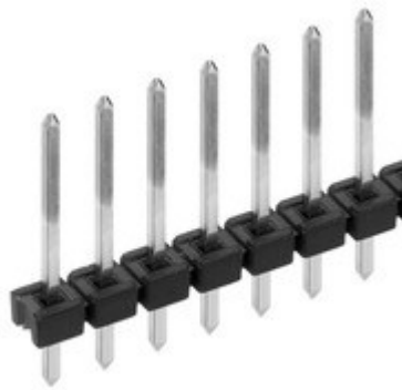
PCB connectors > Male headers Low profile, straight, \square 0.635 mm