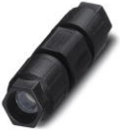
QUICKON conductor connector, 4-pos., connection cross section 0.34-0.75 mm 2 , customer version

Please be informed that the data shown in this PDF Document is generated from our Online Catalog. Please find the complete data in the user's documentation. Our General Terms of Use for Downloads are valid ( http://phoenixcontact.com/download )