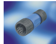
View represents all available contact positions.