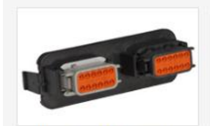
The header will accommodate applications up to 24 contacts, and the keyed connectors provide a positive, consistent connection.