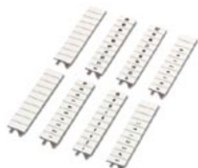
Zack marker strip, 10-section, horizontally labeled with the consecutive numbers: 71 ... 80, white, Width: 5 mm

Please be informed that the data shown in this PDF Document is generated from our Online Catalog. Please find the complete data in the user's documentation. Our General Terms of Use for Downloads are valid ( http://phoenixcontact.com/download )