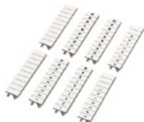
Zack marker strip, 10-section, horizontally labeled with the consecutive numbers: 61 ... 70, white, Width: 5 mm

Please be informed that the data shown in this PDF Document is generated from our Online Catalog. Please find the complete data in the user's documentation. Our General Terms of Use for Downloads are valid ( http://phoenixcontact.com/download )