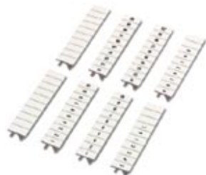
Zack marker strip, 10-section, horizontally labeled with the consecutive numbers: 11 ... 20, white, Width: 5 mm

Please be informed that the data shown in this PDF Document is generated from our Online Catalog. Please find the complete data in the user's documentation. Our General Terms of Use for Downloads are valid ( http://phoenixcontact.com/download )