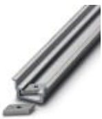
DIN rail, deep drawn, high profile, unperforated, 1.5 mm thick, material: aluminum, height 15 mm, width 35 mm, length 2000 mm

DIN rail, unperforated - NS 35/15 AL UNPERF 2000MM - 1201756