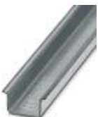
DIN rail, material: Galvanized, unperforated, height 15 mm, width 35 mm, length: 2 m

DIN rail, unperforated - NS 35/15 ZN UNPERF 2000MM - 1206586