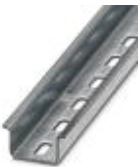
DIN rail, material: Galvanized, perforated, height 15 mm, width 35 mm, length: 2 m

DIN rail perforated - NS 35/15 ZN PERF 2000MM - 1206599