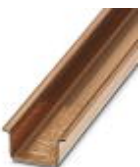
DIN rail, material: Copper, unperforated, 1.5 mm thick, height 15 mm, width 35 mm, length: 2 m

DIN rail, unperforated - NS 35/15 CU UNPERF 2000MM - 1201895