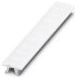
Zack marker strip, Strip, white, labeled, can be labeled with: Plotter, Printed horizontally: Consecutive numbers 1 - 10, 11 - 20, etc. up to 491 - 500, Mounting type: Snap into tall marker groove, for terminal block width: 6.2 mm, Lettering field: 6.15 x 10.5 mm

Zack marker strip - ZB 6,LGS:FORTL.ZAHLEN - 1051016