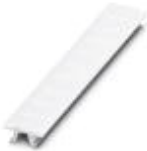
Zack marker strip, can be ordered: Strip, white, labeled according to customer specifications, Mounting type: Snap into tall marker groove, for terminal block width: 6.2 mm, Lettering field: 6.15 x 10.5 mm

Zack marker strip - ZB 6,LGS:FORTL.ZAHLEN - 1051016