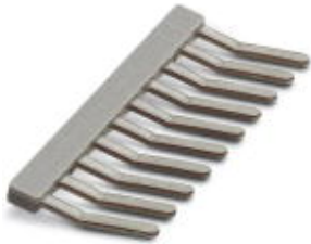
Insertion bridge, Number of positions: 10, Color: gray

Please be informed that the data shown in this PDF Document is generated from our Online Catalog. Please find the complete data in the user's documentation. Our General Terms of Use for Downloads are valid ( http://phoenixcontact.com/download )