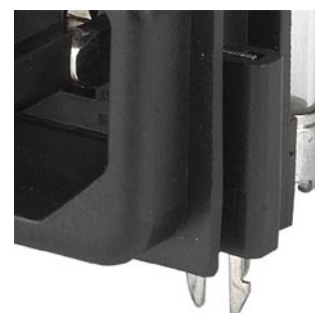
Pick &amp; Place Version