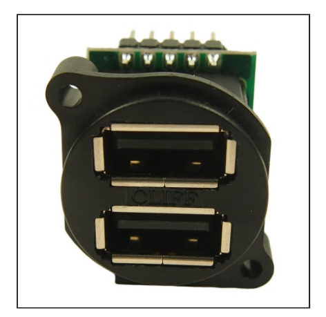
PART No. CP30090

Dual USB2 compliant sockets are mounted in a single spacesaving universal XLR receptacle, chosen to allow industry standard panel cutouts and maximum panel mounting density. The two USB2 sockets provide isolated and independent output connection to two rows of 5 x 2.54mm (0.1") pitch output pins. These are configured to facilitate either direct soldering to PCBs or connection by header cable. We are happy to provide customers with standard or custom designed header cables to meet individual system requirements.