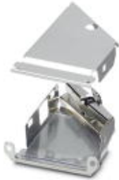
D-SUB EMC inner sleeve, shell size 3, for sleeve housing VS-25-...

Please be informed that the data shown in this PDF Document is generated from our Online Catalog. Please find the complete data in the user's documentation. Our General Terms of Use for Downloads are valid ( http://phoenixcontact.com/download )