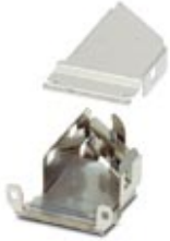
D-SUB EMC inner sleeve, shell size 2, shielded, for sleeve housing VS-15-...

Please be informed that the data shown in this PDF Document is generated from our Online Catalog. Please find the complete data in the user's documentation. Our General Terms of Use for Downloads are valid ( http://phoenixcontact.com/download )