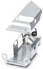
D-SUB EMC inner sleeve, for sleeve housing VS-09-..., shell size 1, shielded

Please be informed that the data shown in this PDF Document is generated from our Online Catalog. Please find the complete data in the user's documentation. Our General Terms of Use for Downloads are valid ( http://phoenixcontact.com/download )