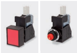
C0911RB --- C0911PB ---