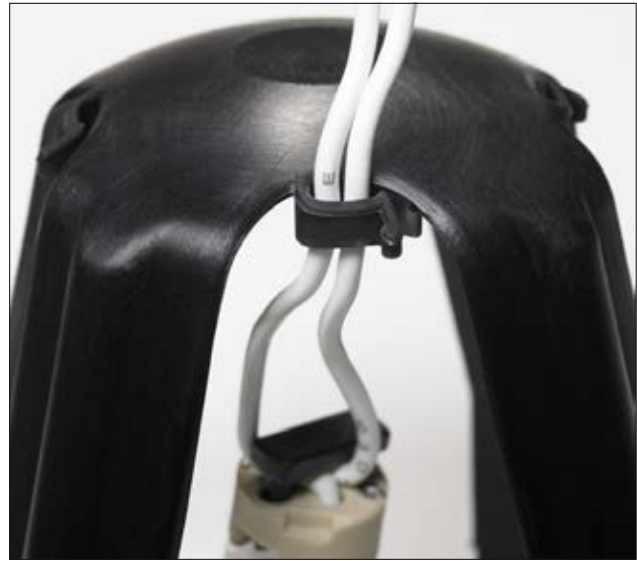
Cable retainers on the heat protection top hold the supply cable in place.