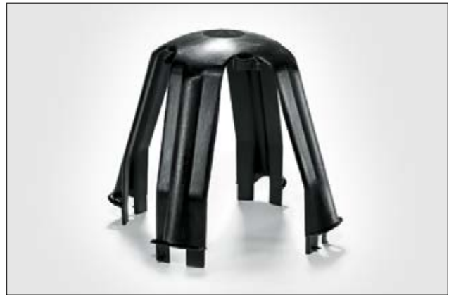
Optimization of 4 fastening feet.