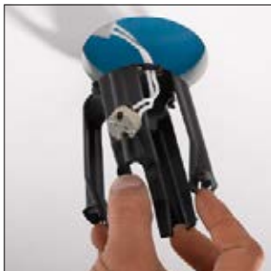
1. Squeeze the mounting legs to install SpotClip in the fixing hole.