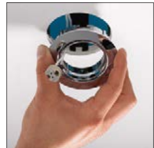
4. The downlight can now be safely and securely installed.