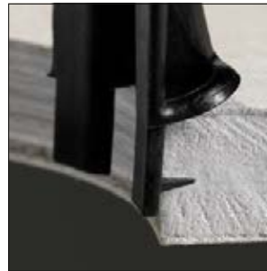
Additional retaining spikes prevent movement during mounting.