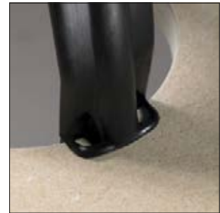
Bearing wings ensure that the spacer locates securely on the plasterboard.