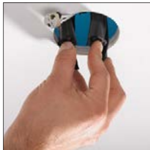
2. Place SpotClip in the desired position.