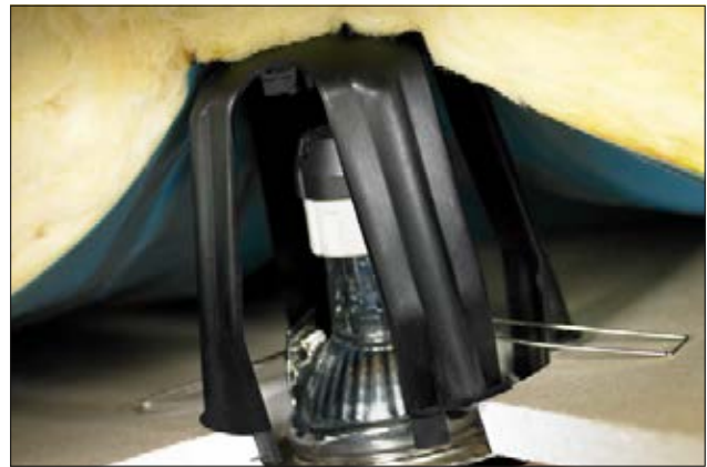
SpotClip-I installed in a dry mortarless construction with insulation wool.

It reduces the risk of damage being caused to any insulation material as a result of overheating and heat accumulation and may also have a positive effect on the life time of the lamp.