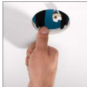
3. Push the spikes into the plasterboard to prevent shifting.