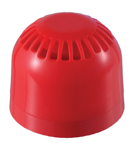
Applications - Fire; security; industrial alarm