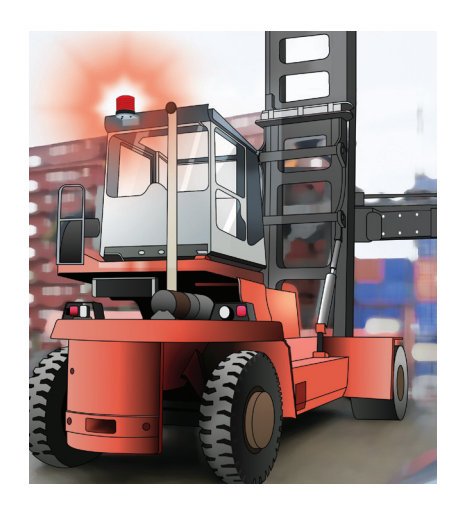
S80LS has an extremely bright signal light that reduces signal attenuation under direct sunlight. Therefore, signal light output of this lamp has excellent visibility similar to a bulb or xenon lamp in daytime.