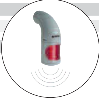
High visibility LED Traffic Light with integrated siren see page 181