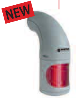
LED Beacon (1 tier)