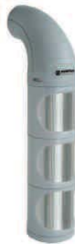
LED Traffic Light (3 tier)