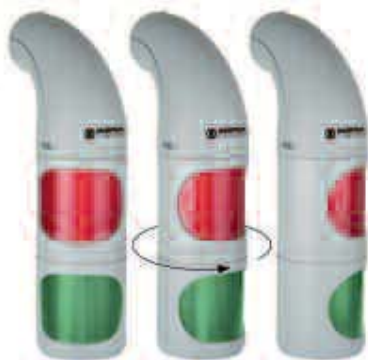
The direction of the optical signal can be individually adjusted