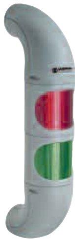
Innovative design option with the attachment of a second fixing bow (accessory)