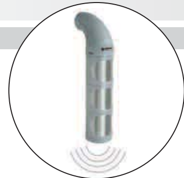
High visibility LED Traffic Light with integrated siren see page 180