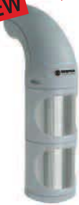
LED Traffic Light (2 tier)