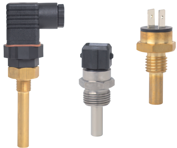
Bimetal temperature switch, model TFS35